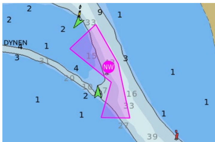
Figure 1: Snippet of an ECDIS showing AIS data (other ships as green icons) and AIS 2.0 information (navigational warning with a polygon-shaped area)

VDES is a new standard that extends AIS with much more bandwidth and global two-way data exchange via coastal networks and satellites. Together with supplementary technologies, it paves the way for what we call “AIS 2.0”, which enables a range of advanced digital services to be used on the ship bridge. A very basic example of AIS 2.0 is seen in Figure 1.